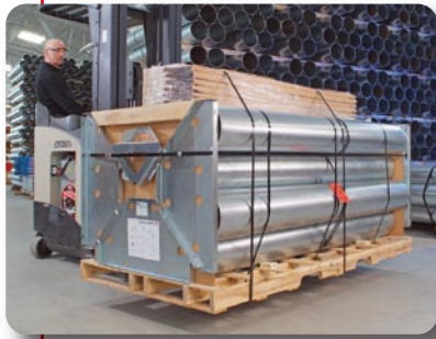
Envirocrate™ shipping package reduces waste

Start your wind energy measurement study with the complete, NRG XHD NOW System —the wind industry's #1 choice for long-term, professional wind energy measurement studies. The XHD TallTower is the largest diameter tilt-up tubular tower in the wind industry—built to last and survive extreme weather conditions, worldwide. The Systems deploy quickly and easily and are ready to ship. NRG XHD NOW Systems are always the right choice.